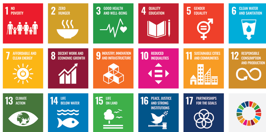
Figure 1 Icons of the 17 Sustainable Development Goals

a key role, and a disproportionately important one, in economically developed countries such as the UK. Here, goal-related learning by students can help increase the likelihood that the goals will be valued, supported and